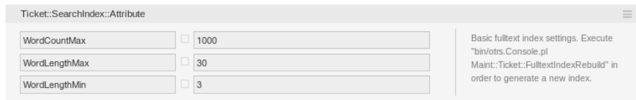
Fig. 1: Ticket::SearchIndex::Attribute Setting

Ticket::SearchIndex::Attribute Basic full-text index settings.