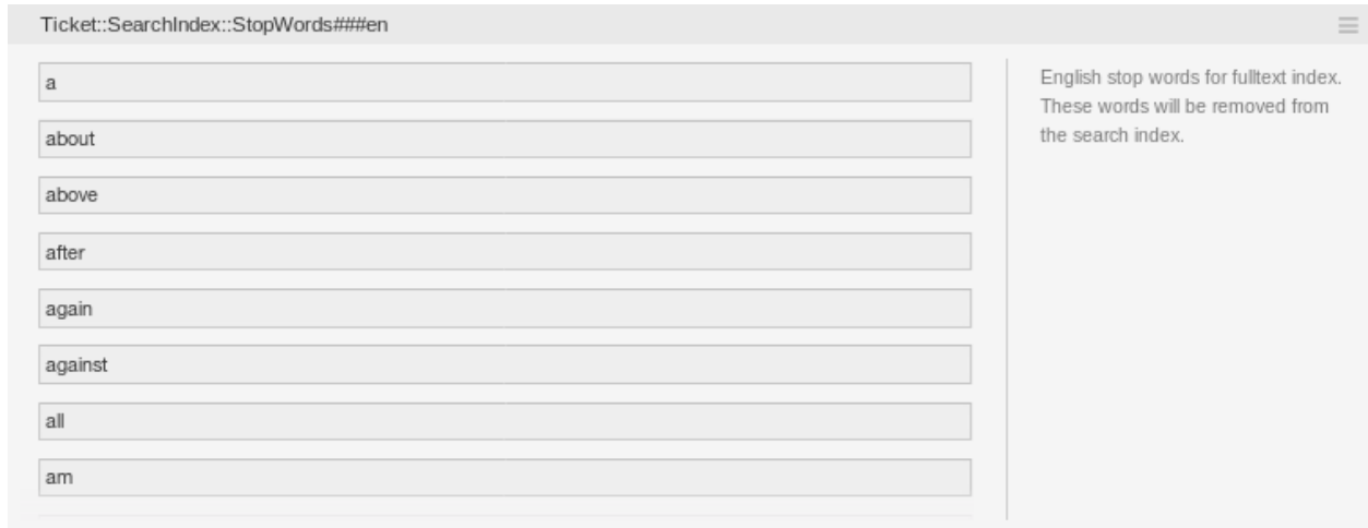
Fig. 3: Ticket::SearchIndex::StopWords###en Setting