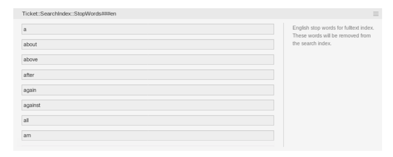
Fig. 13.3: Ticket::SearchIndex::StopWords###en Setting

There are so-called stop-words defined for some languages. These stop-words will be skipped while creating the search index.